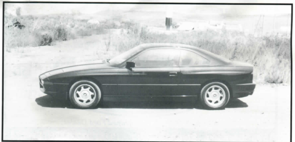
One of Von Helm's stolen luxury cars, worth $85,000 to $100,000